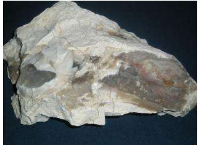
Above: Opalite – The Stone of Eternity

I can't remember where every specific crystals sits, though I do tend to arrange them in colours – ie; soft pinks, lilacs, blue will be placed together, whilst stronger colours of orange, red, brown nestle together, etc. I found the small Opalite, which is the size of a small marble, glowing in a huge crystal bowl, bequeathed to me by my Polish family, and amongst an array of stunning stones of natural quartz crystal through to a palm stone of Lepidolite. The finding of the Opalite was exciting, for as I searched, I saw each crystal through new eyes, they never cease to amaze